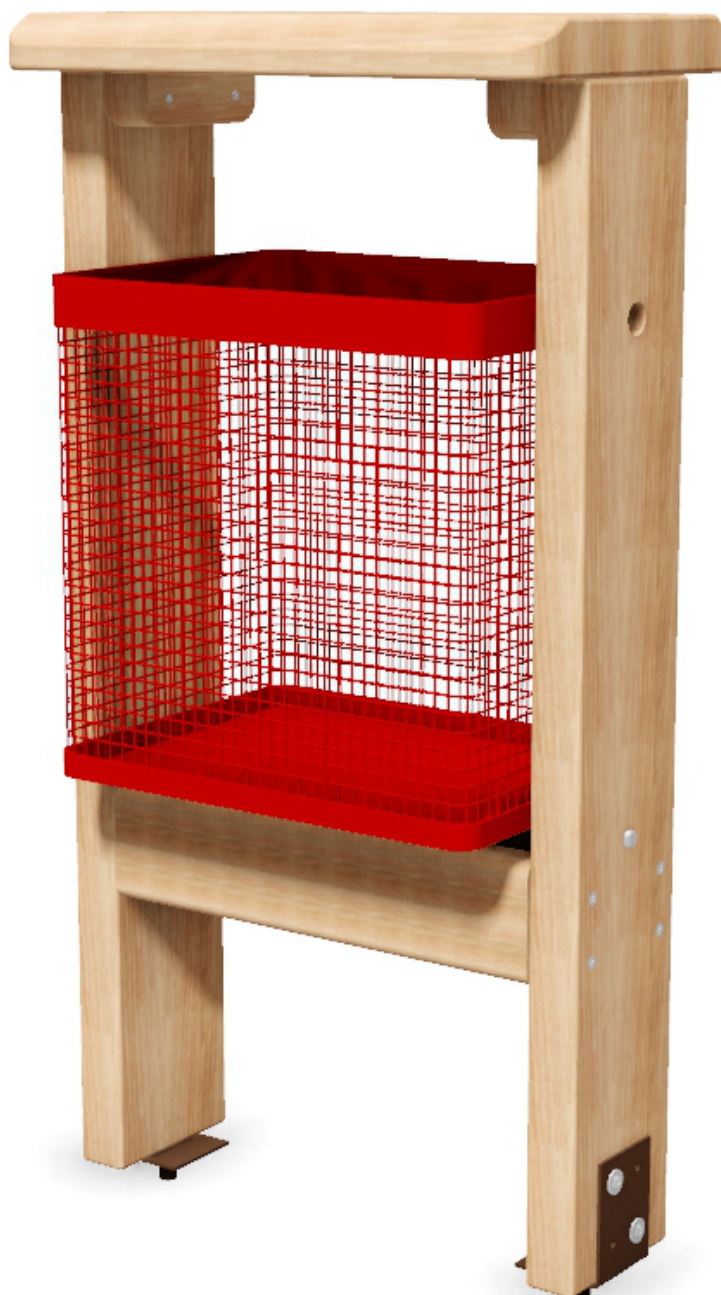
York Bin : PRO-500-256

Description : Open fronted litter bin, which pivots at the top for ease of emptying.