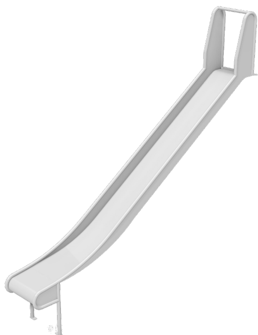
SL1 - Standard Width

Our slides are manufactured from 2mm 304 stainless steel sheet with a 38mm diameter safety bar and 25mm diameter top safety rail where required.